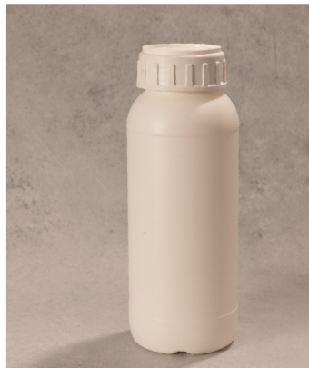
LIQUID/CHEMICAL BOTTLE SIZE: 500 ML