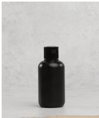
COSMETIC BOTTLE SIZE: 100 ML