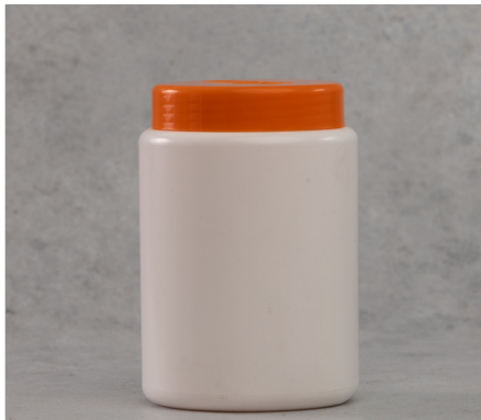
HING CONTAINER SIZE: 500 GRAMS