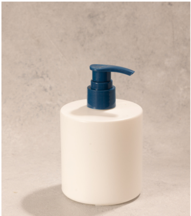
COSMETIC BOTTLE SIZE: 300 ML