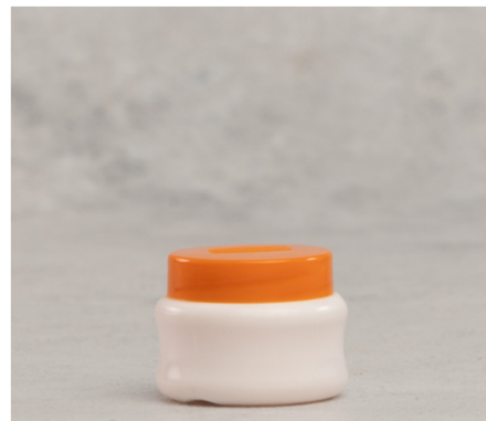
HING CONTAINER SIZE: 10 GRAMS