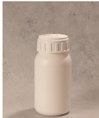
LIQUID/CHEMICAL BOTTLE SIZE: 250 ML