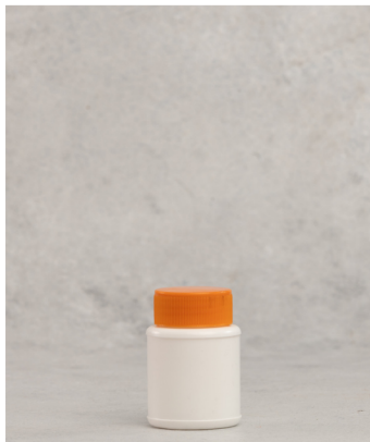
ROUND TABLET CONTAINER SIZE: 75 CC