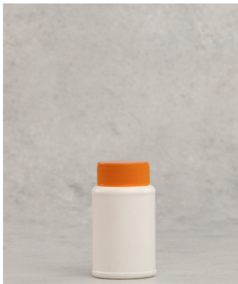
ROUND TABLET CONTAINER SIZE: 100 CC