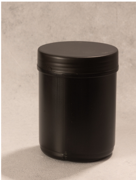
ROUND TABLET CONTAINER SIZE: 400 G