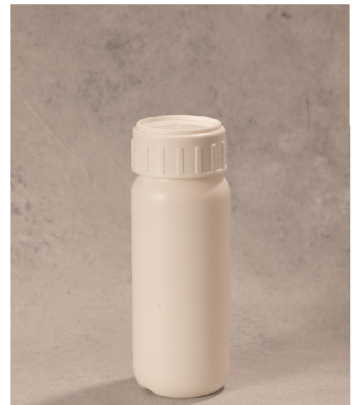
LIQUID/CHEMICAL BOTTLE SIZE: 100 ML