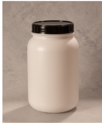
ROUND TABLET CONTAINER SIZE: 3840ML