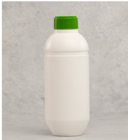
LIQUID/CHEMICAL BOTTLE SIZE: 500 ML