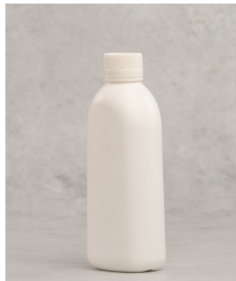
COSMETIC BOTTLE SIZE: 100 ML