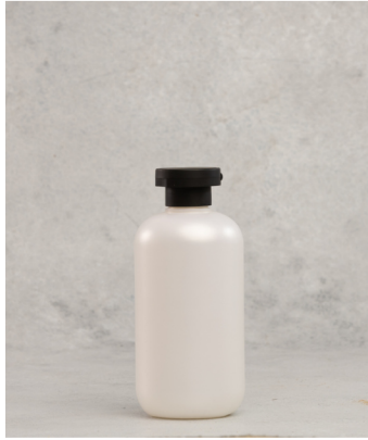
COSMETIC BOTTLE SIZE: 350 ML