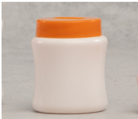
HING CONTAINER SIZE: 25 GRAMS