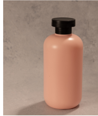
COSMETIC BOTTLE SIZE: 350 ML