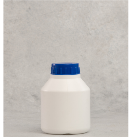
LIQUID/CHEMICAL BOTTLE SIZE: 400 ML