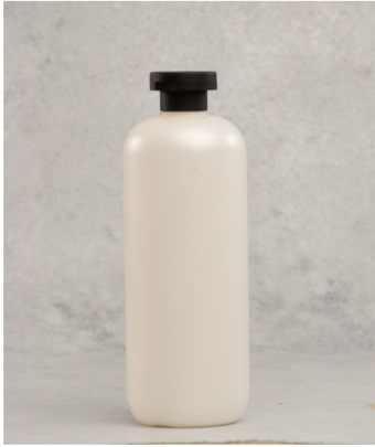
COSMETIC BOTTLE SIZE: 500 ML