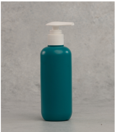
COSMETIC BOTTLE SIZE: 200 ML