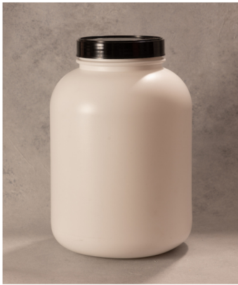
ROUND TABLET CONTAINER SIZE: 7485ML