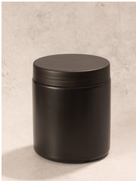
ROUND TABLET CONTAINER SIZE: 400 G