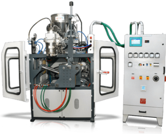
BLOW MOULDING MACHINES