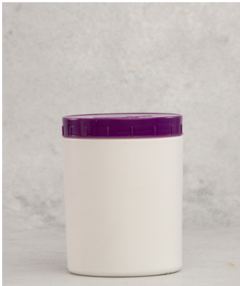
POWDER CONTAINER SIZE: 200 GRAMS