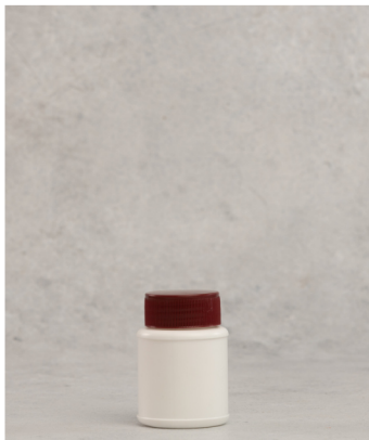
ROUND TABLET CONTAINER SIZE: 75 CC