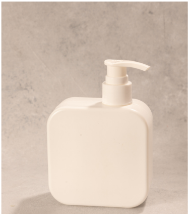
COSMETIC BOTTLE SIZE: 300 ML