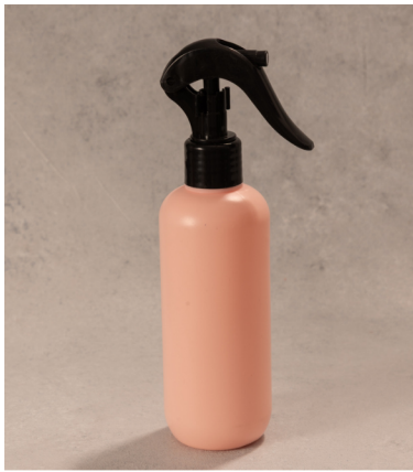
COSMETIC BOTTLE SIZE: 200 ML