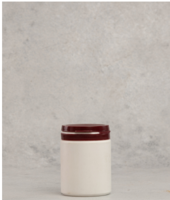
POWDER CONTAINER SIZE: 250 CC