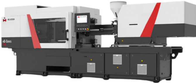
HORIZONTAL INJECTION MOULDING MACHINES