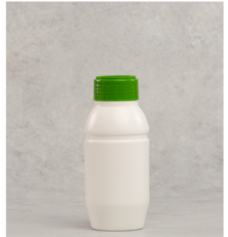
LIQUID/CHEMICAL BOTTLE SIZE: 200 ML