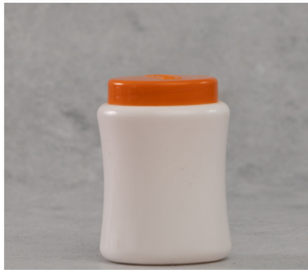
HING CONTAINER SIZE: 100 GRAMS