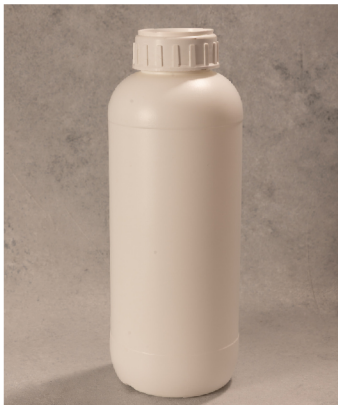
LIQUID/CHEMICAL BOTTLE SIZE: 1000 ML