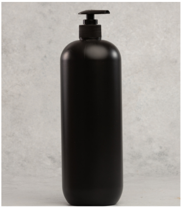
COSMETIC BOTTLE SIZE: 1000 ML