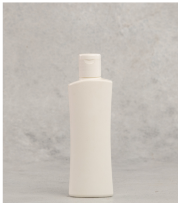
COSMETIC BOTTLE SIZE: 100 ML