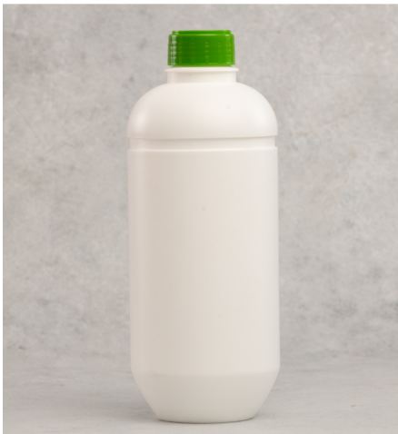
LIQUID/CHEMICAL BOTTLE SIZE: 1000 ML