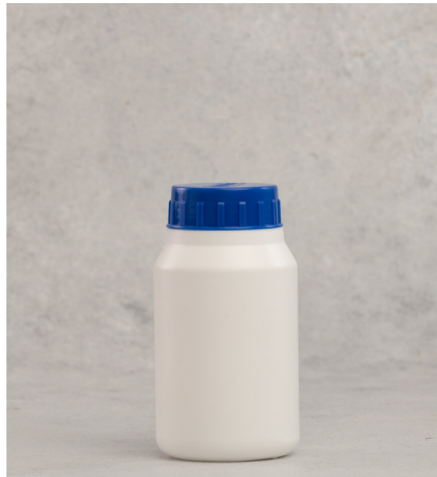
LIQUID/CHEMICAL BOTTLE SIZE: 200 ML