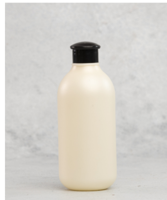
COSMETIC BOTTLE SIZE: 200 ML