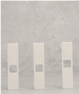
HDPE PFS TRAY