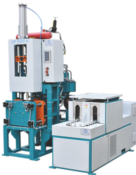
PET BLOW MOULDING MACHINES