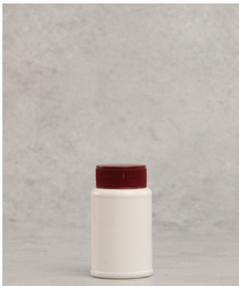
ROUND TABLET CONTAINER SIZE: 100 CC