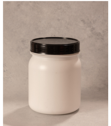
ROUND TABLET CONTAINER SIZE: 2000 ML