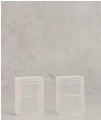
PP AMPOULES & VIALS TRAY