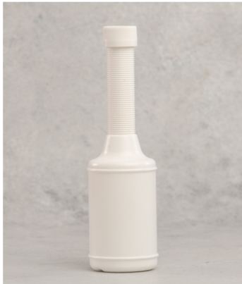
DRENCH BOTTLE SIZE: 175ML