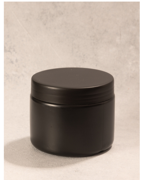
ROUND TABLET CONTAINER SIZE: 100 G