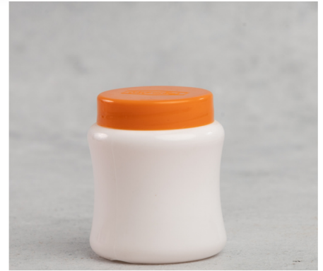
HING CONTAINER SIZE: 50 GRAMS