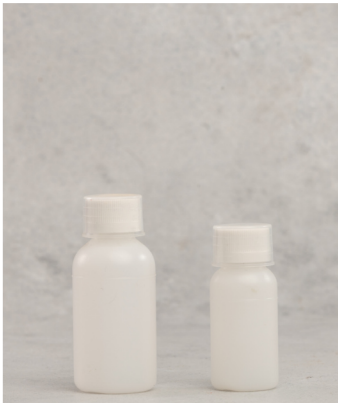
DRY SYRUP BOTTLE SIZE: 30ML, 60 ML