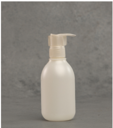
COSMETIC BOTTLE SIZE: 150 ML