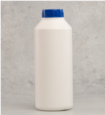
LIQUID/CHEMICAL BOTTLE SIZE: 1000 ML